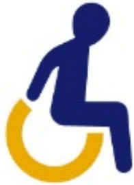
People living with disabilities