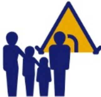
People in humanitarian contexts