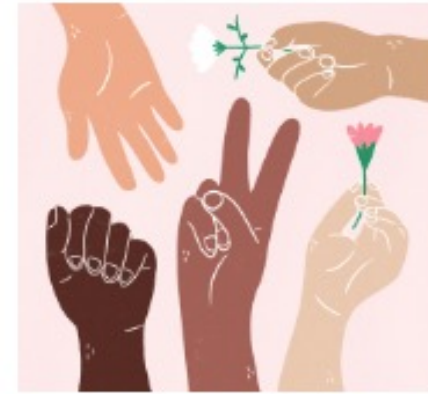
People of marginalised racial and ethnic identity